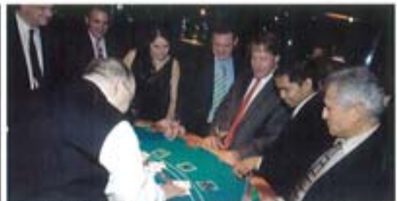
Brooklyn CareWorks' try their luck at the casino tables.