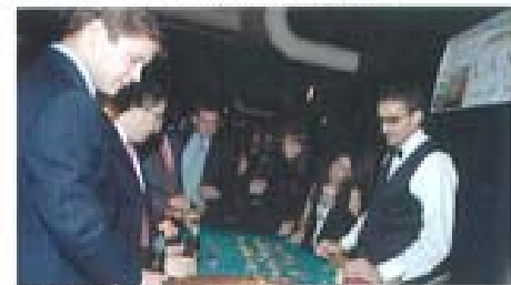
Guests at Brooklyn CareWorks' Gala play roulette